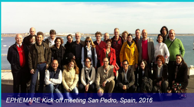
EPHEMARE Kick-off meeting San Pedro, Spain, 2016

The EPHEMARE project kick-off meeting took place in San Pedro, Murcia, Spain on the 19th and 20th of January, 2016. The meeting brought experts from Spain, France, Italy, Portugal, Germany, Belgium, Sweden, Norway, Ireland and the UK together and allowed face to face meeting with project partners, facilitating great discussions about the EPHEMARE investigation into the toxic effects of microplastics on marine organisms.