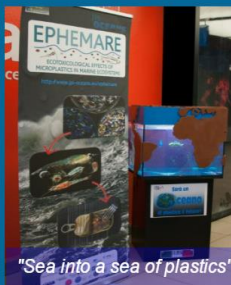
"Sea into a sea of plastics"

"Sea into a sea of plastics" highlighted problems associated with microplastics in marine environments, with particular attention to the research activities of the Regional Environmental Protection Agency of Liguria (ARPAL). The laboratory was carried out by scientific entertainers and Italian EPHEMARE partners who, through audio-video devices, engaged the visitors in different practical activities. The central focal point and setting of this lab was a specially designed tank, representing the marine ecosystem, containing plastics and marine organisms, simulating a "Sea into a Sea of Plastics". The lab represented an opportunity to address an issue of great relevance, raise questions and to find potential solutions.