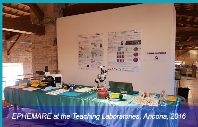
EPHEMARE at the Teaching Laboratories, Ancona, 2016

The laboratory of Ecotoxicology of Marche Polytechnic University (UPM) participated in the event "TIPICTÀ IN BLU", which was held in Ancona (19th-22nd of May 2016), to raise public awareness relating to: Blue economy and Blue growth, seafood safety and protection of the marine environment.