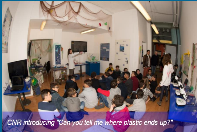
CNR introducing "Can you tell me where plastic ends up?"

This lab presented an opportunity to think about daily problems which do not receive much attention. "Can you tell me where plastics end up?" focused on discovery through practical experiences allowing participants to understand how to monitor and select tools that are used to quantify and recognise microplastics in marine waters and sediment samples. The lab showed how field sampling activities are performed and offered the possibility to do some practical and scientific trials, simulating researchers' activities, such as the separation of plastics from different matrices.