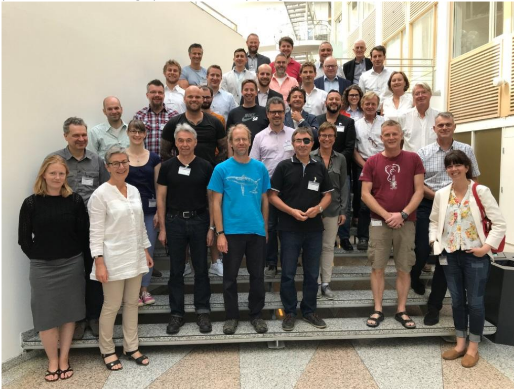
Fifty-five participants from 8 different European countries at the JPI-Ocean Munition workshop in Oslo in June 2018. Delegates included expert researchers, regulators/authorities, industry, and operational EOD-operators.

The first day was devoted to key presentations of selected themes to update the group on recent progress. The first part of the second day was filled with national presentations about management and challenges related to dumped munitions. This gave a common fundament for the workgroup sessions the rest of the second day. The last day was devoted to discussions about knowledge gaps, priorities and summing up. The workshop program is enclosed in annex II.